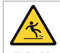
Slip, Trip, Falls