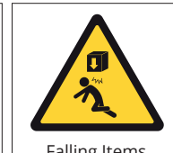
Falling Items from Above