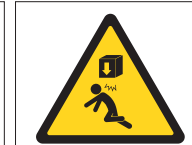
Falling Items from Above