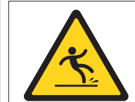
Slip, Trip, Falls