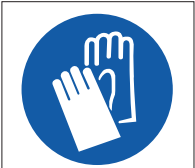
Hand Protection Gloves can be removed to untie/tie rope knots