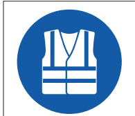
Hi Vis Wear