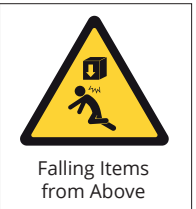
Falling Items from Above