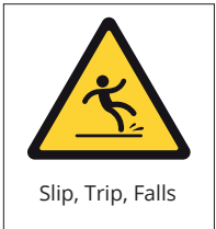
Slip, Trip, Falls