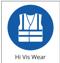
Hi Vis Wear